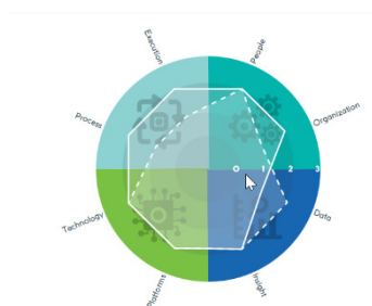
Fig 3. Representing a possible outcome from the framework analysis

The team must also consider how these profiles will ultimately be used to drive targeted HCPs in a multi-channel campaign. While sales representatives have historically presented patient profiles in personal selling, more and more advertising are shifting to impersonal and digital advertising. It emphasizes that the suggestions and tips presented in the patient case must be realistic and unmistakably clear.