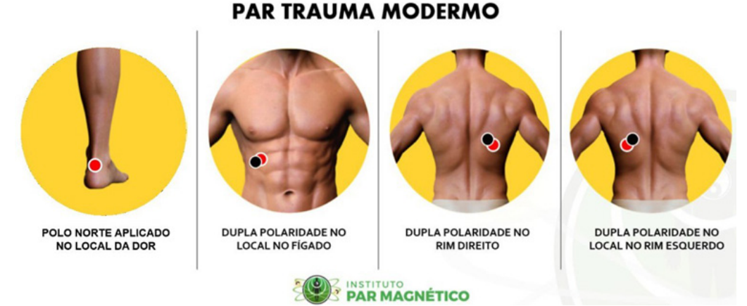
Figure 1: Modern Trauma Protocol (MTP)

Legend: The first image represents the application of the magnet's north polarity onto the algal complaint, represented on the heel tendon of the lower right limb. This is the only variable region of application of the magnets and remains on the anatomical point of pain complaint of each participant. The second image represents the application of double polarity of the magnets in the region of the liver, following the clavicular middle line, the north pole being applied medial and higher in relation to the south pole. The application follows 5 fingers below the nipple. The third and fourth images represent the application of double polarity in the upper region of the kidneys, the south pole being applied medial and upper relative to the north pole, at the height between the dorsal vertebrae 9 and 11. Image source: application of double polarity in the upper region of the kidneys, the south pole being applied medial and upper relative to the north pole, at the height between the dorsal vertebrae 9 and 11. Image source: