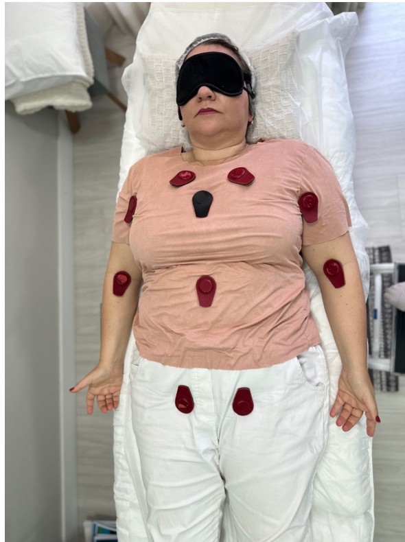
Figure 2: Practical Application of the ALP

supine position (Figure 2), where the ALP was applied for a period of 1 hour. Three interventions were conducted with a 7-day interval between each session.